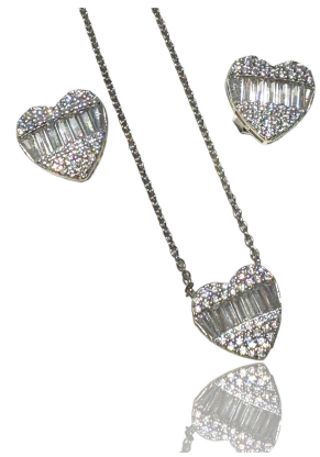
CONJUNTO CORAÇÃO BAGUETTES E CRISTAIS ZIRCÔNIAS PRATA 925

Preço: R$689,90 Original price was: R$689,90. R$620,91 Curr ent price is: R$620,91.