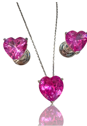
CONJUNTO CORAÇÃO PINK PRATA 925

Preço: R$629,90 Original price was: R$629,90. R$566,91 Curr ent price is: R$566,91.