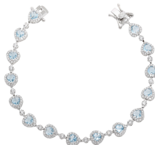
PULSEIRA RIVIERA VÁRIOS CORAÇÕES AGUA MARINHA PRATA CRISTAIS 925

Preço: R$569,90 Original price was: R$569,90. R$512,91 Curr