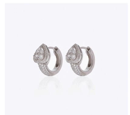
ARGOLA LUXO CORÇÃO ZIRCÔNIAS BRANCAS PRATA 925

Preço: R$789,90 Original price was: R$789,90. R$710,91 Curr ent price is: R$710,91.