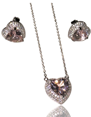
CONJUNTO CORAÇÃO MORGANITA E CRISTAIS EM VOLTA ZIRCÔNIAS PRATA 925

Preço: R$729,90 Original price was: R$729,90. R$656,91 Curr ent price is: R$656,91.