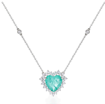
COLAR CORAÇÃO LUXO COLOMBIANA ZIRCÔNIAS PRATA

Peças especiais para o Dia dos Namorados!